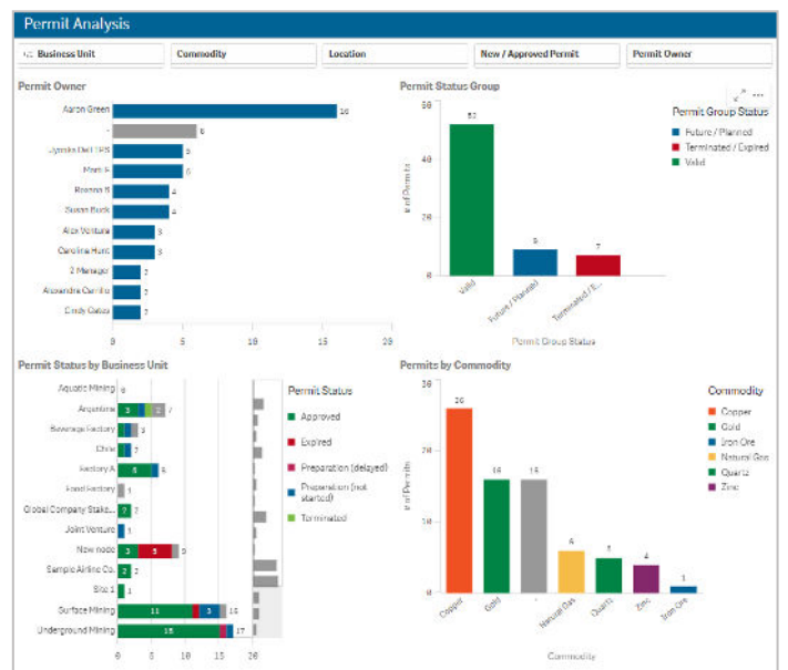
Permit Management Dashboard