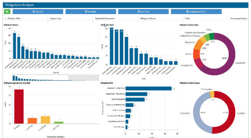
Compliance Obligation Dashboard

Volumes of compliance obligations and conditions: regulations, permits, licenses, and agreements must be meticulously managed.