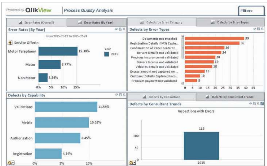
Process quality analysis