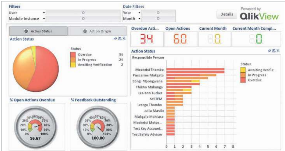
Status of actions