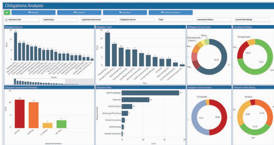
Compliance Management as a solution and integrated with HSE management

Summary views are a powerful means to snapshot compliance status across the business. View total obligations by status and total actions by due date.